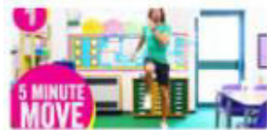
5 Minute Workout