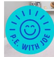
PE with Joe Wicks