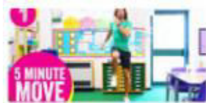
5 Minute Workout