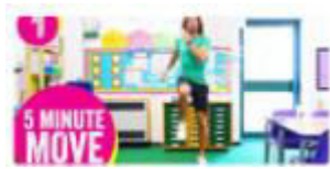
5 Minute Work Out