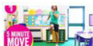
5 Minute Work Out