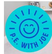
PE with Joe Wicks