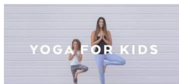
Free Kids Yoga & Meditation from Alo Gives