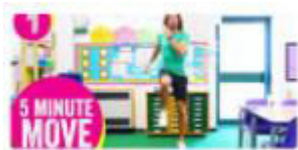
5 Minute Workout