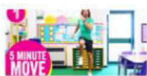
5 Minute Workout