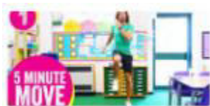
5 Minute Workout