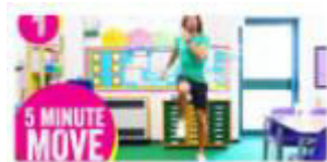
5 Minute Work Out