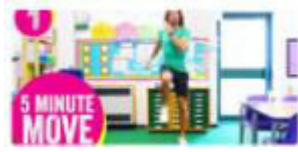
5 Minute Work Out