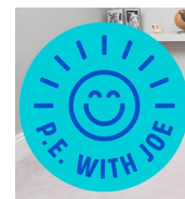
PE with Joe Wicks