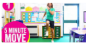
5 Minute Workout