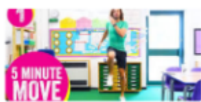
5 Minute Workout