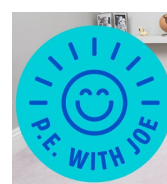
PE with Joe Wicks