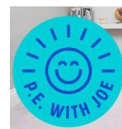
PE with Joe Wicks