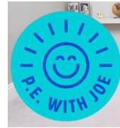
PE with Joe Wicks