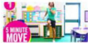
5 Minute Workout