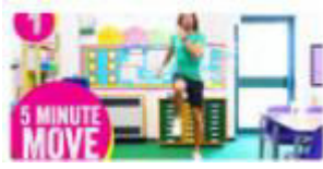
5 Minute Workout