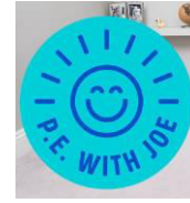
PE with Joe Wicks