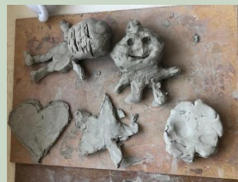
Clay work by children attending OT